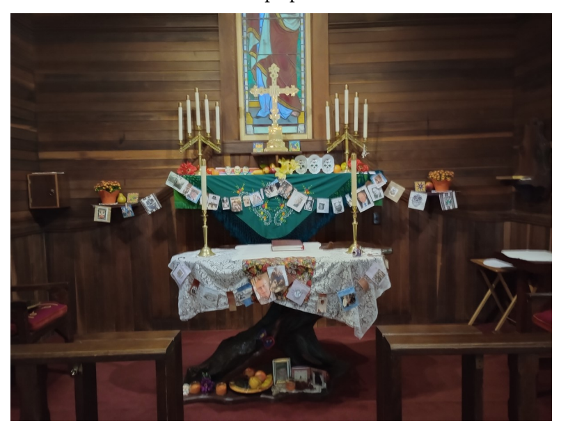
The altar at St. Andrew's is prepared for Dia de los Muertos